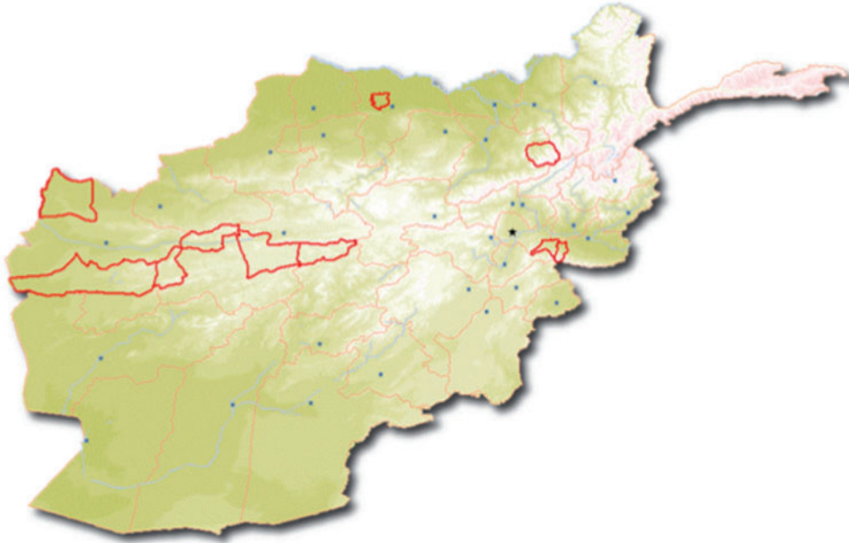
FIGURE 1 Ten sample districts

The average population in our sample of villages is roughly 1,000 people (see Table 1). There is notable variation in the geographic size of villages, with quite a few villages spanning several kilometres. The average distance between the house of a randomly selected survey respondent and the centre of the village is about 400 m, with a standard deviation of more than 1 km. About 25% of villages are ethnically mixed, with the rest being exclusively Pashtun, Tajik, or Hazara (as well as one Turkmen village). The average level of education in the sampled villages is very low, with more than 70% of adult male villagers having no formal education and only 4% having finished high school. An average household consists of ten people, of which about five are children under the age of fifteen. The sample villages are also very poor: only 45% of respondents indicate that they never or rarely have problems supplying food for their families. 19